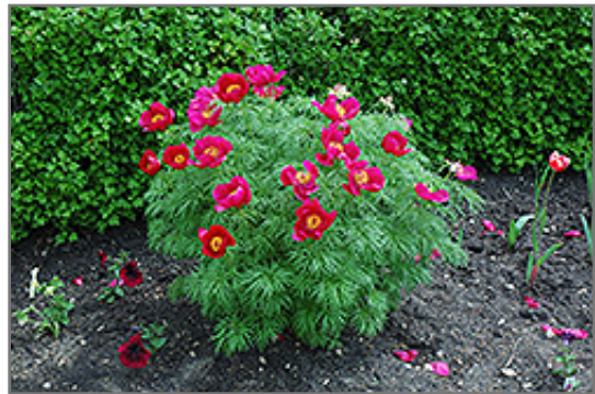
Fernleaf Peony in bloom