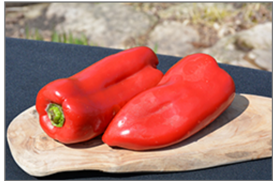
Gypsy Sweet Pepper fruit