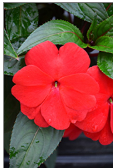
Super Sonic Dark Red New Guinea Impatiens flowers