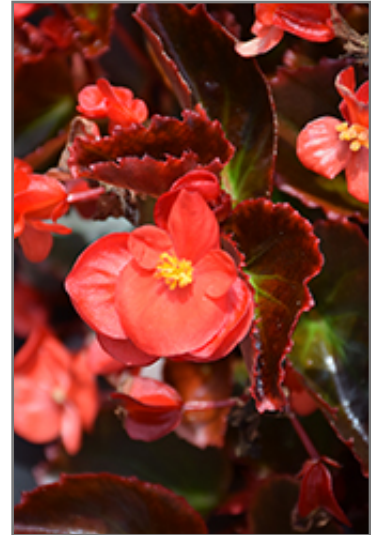
Senator IQ Scarlet flowers