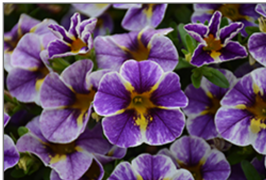
Superbells Holy Smokes! Calibrachoa flowers

Superbells Holy Smokes! Calibrachoa is a dense herbaceous annual with a trailing habit of growth, eventually spilling over the edges of hanging baskets and containers. Its medium texture blends into the garden, but can always be balanced by a couple of finer or coarser plants for an effective composition.