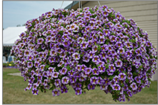
Superbells Holy Smokes! Calibrachoa in bloom