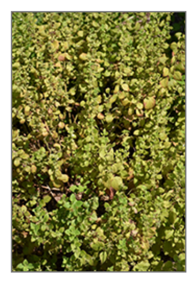
Citronella Lemon Balm foliage