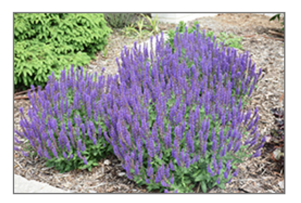
Royal Rembrandt Speedwell in bloom