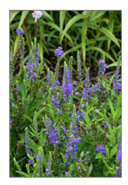
Royal Rembrandt Speedwell flowers