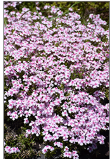
Coral Eye Moss Phlox flowers