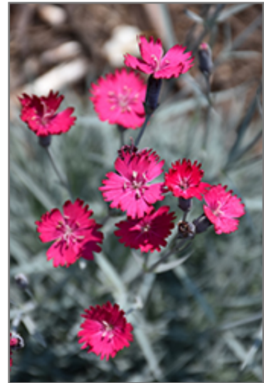
Wicked Witch Pinks flowers

Wicked Witch Pinks is recommended for the following landscape applications;