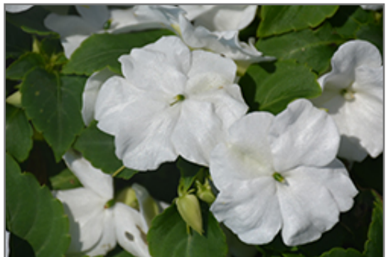
Accent Premium White Impatiens flowers

Accent Premium White Impatiens is recommended for the following landscape applications;