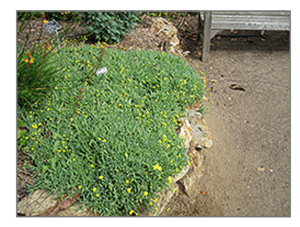
Little Pickles in bloom

Little Pickles will grow to be only 4 inches tall at maturity extending to 6 inches tall with the flowers, with a spread of 12 inches. Although it's not a true annual, this plant can be expected to behave as an annual in our climate if left outdoors over the winter, usually needing replacement the following year. As such, gardeners should take into consideration that it will perform differently than it would in its native habitat.