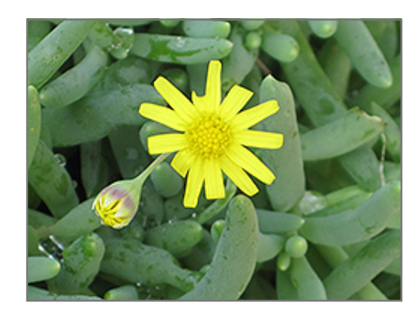
Little Pickles flowers

Little Pickles is recommended for the following landscape applications;