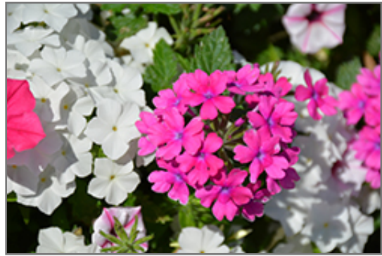
Superbena Pink Shades Verbena flowers

Superbena Pink Shades Verbena is recommended for the following landscape applications;