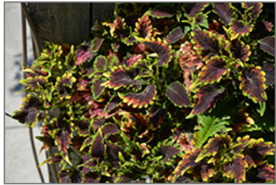
Sky Fire Coleus foliage

Sky Fire Coleus is recommended for the following landscape applications;