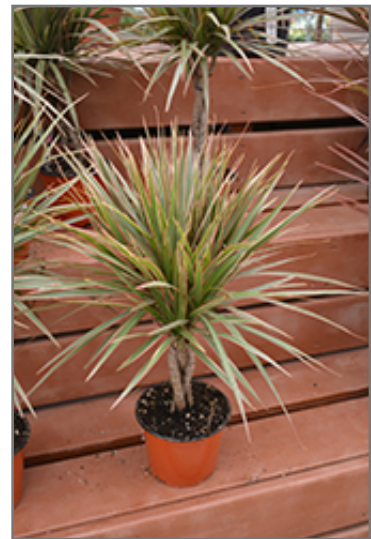
Colorama Dracaena in full

When grown indoors, Colorama Dracaena can be expected to grow to be about 3 feet tall at maturity, with a spread of 24 inches. It grows at a medium rate, and under ideal conditions can be expected to live for approximately 10 years. This houseplant performs well in both bright or indirect sunlight and strong artificial light, and can therefore be situated in almost any well-lit room or location. It does best in average to evenly moist soil, but will not tolerate standing water. The surface of the soil shouldn't be allowed to dry out completely, and so you should expect to water this plant once and possibly even twice each week. Be aware that your particular watering schedule may vary depending on its location in the room, the pot size, plant size and other conditions; if in doubt, ask one of our experts in the store for advice. It is not particular as to soil type or pH; an average potting soil should work just fine.