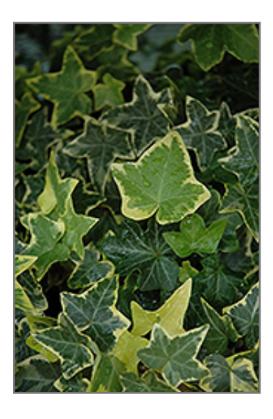
Gold Child Ivy foliage

When grown indoors, Gold Child Ivy can be expected to grow to be about 10 feet tall at maturity, with a spread of 3 feet. It grows at a medium rate, and under ideal conditions can be expected to live for approximately 30 years. This houseplant performs well in both bright or indirect sunlight and strong artificial light, and can therefore be situated in almost any well-lit room or location. It prefers to grow in average to moist soil. The surface of the soil shouldn't be allowed to dry out completely, and so you should expect to water this plant once and possibly even twice each week. Be aware that your particular watering schedule may vary depending on its location in the room, the pot size, plant size and other conditions; if in doubt, ask one of our experts in the store for advice. It is not particular as to soil pH, but grows best in rich soil. Contact the store for specific recommendations on pre-mixed potting soil for this plant. Be warned that parts of this plant are known to be toxic to humans and animals, so special care should be exercised if growing it around children and pets.