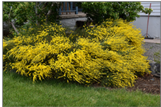
Spanish Gold Broom in bloom