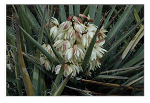
Banana Yucca flowers

Banana Yucca is a multi-stemmed evergreen shrub with a more or less rounded form. Its relatively coarse texture can be used to stand it apart from other landscape plants with finer foliage.