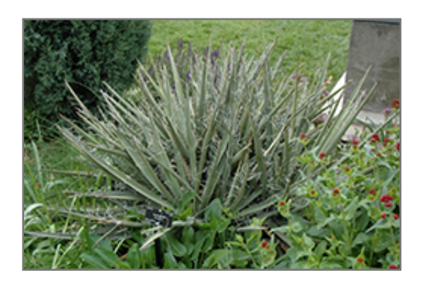
Banana Yucca