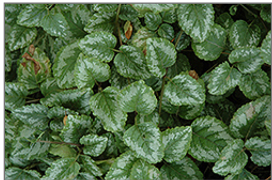
Jade Frost Archangel foliage