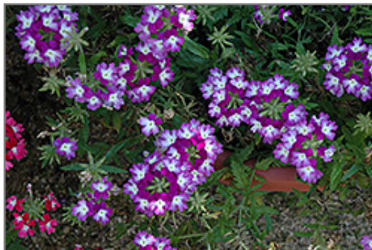
Lanai Twister Purple Verbena flowers

This plant will require occasional maintenance and upkeep. Trim off the flower heads after they fade and die to encourage more blooms late into the season. Deer don't particularly care for this plant and will usually leave it alone in favor of tastier treats. It has no significant negative characteristics.