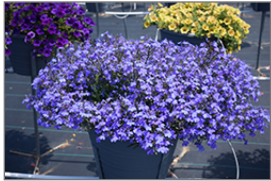
Techno Electric Blue Lobelia in bloom

Techno Electric Blue Lobelia is a fine choice for the garden, but it is also a good selection for planting in hanging baskets. Because of its trailing habit of growth, it is ideally suited for use as a 'spiller' in the 'spiller-thriller-filler' container combination; plant it near the edges where it can spill gracefully over the pot. Note that when growing plants in outdoor containers and baskets, they may require more frequent waterings than they would in the yard or garden.