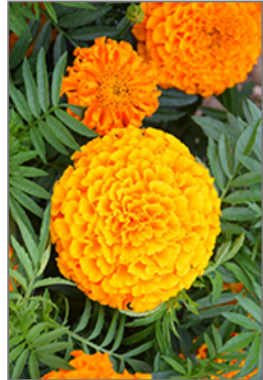
Taishan Orange Marigold flowers