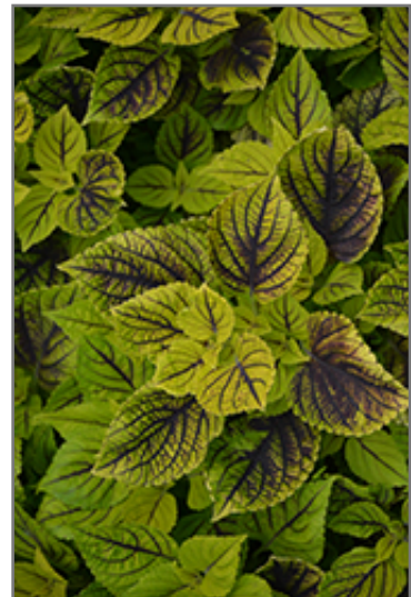
Gays Delight Coleus foliage