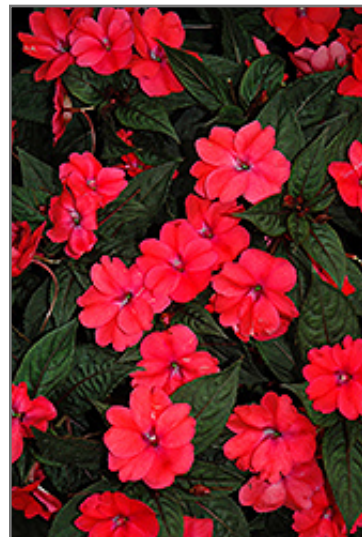
SunPatiens Compact Deep Rose New Guinea Impatiens flowers

This plant will require occasional maintenance and upkeep, and should not require much pruning, except when necessary, such as to remove dieback. It is a good choice for attracting bees and butterflies to your yard. It has no significant negative characteristics.