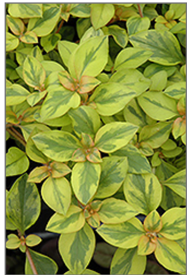
Walkabout Sunset Loosestrife foliage

Walkabout Sunset Loosestrife is recommended for the following landscape applications;