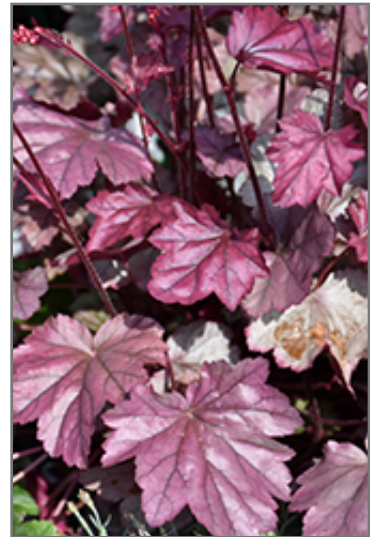
Stainless Steel Coral Bells foliage