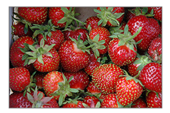
Chandler Strawberry fruit

Chandler Strawberry features dainty white daisy flowers with yellow eyes along the stems in mid spring. Its tomentose round compound leaves remain green in color throughout the season. It features an abundance of magnificent cherry red berries in early summer.