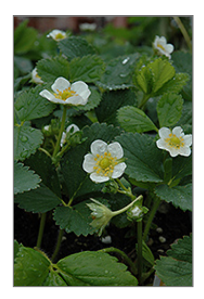
Chandler Strawberry flowers