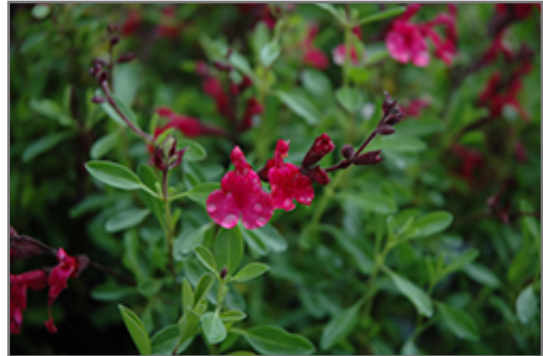
Furman's Red Texas Sage flowers

This is a relatively low maintenance plant, and should only be pruned after flowering to avoid removing any of the current season's flowers. It is a good choice for attracting bees, butterflies and hummingbirds to your yard, but is not particularly attractive to deer who tend to leave it alone in favor of tastier treats. It has no significant negative characteristics.